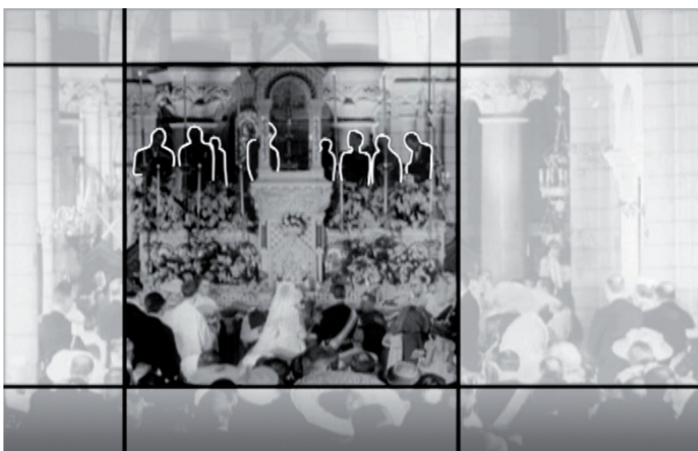
Figure 1. A technical rehearsal took place before the event so that the lighting would clearly illuminate the groom and bride in her ivory dress. Microphone positioning was particularly important for the TV coverage, and priests were recruited to move them when necessary.

The two British newsreel companies, Pathe and Movietone, ended up by showing less than their two minutes' ration of footage from the cathedral. Pathe ran a three and a half minute item with just less than half showing events inside