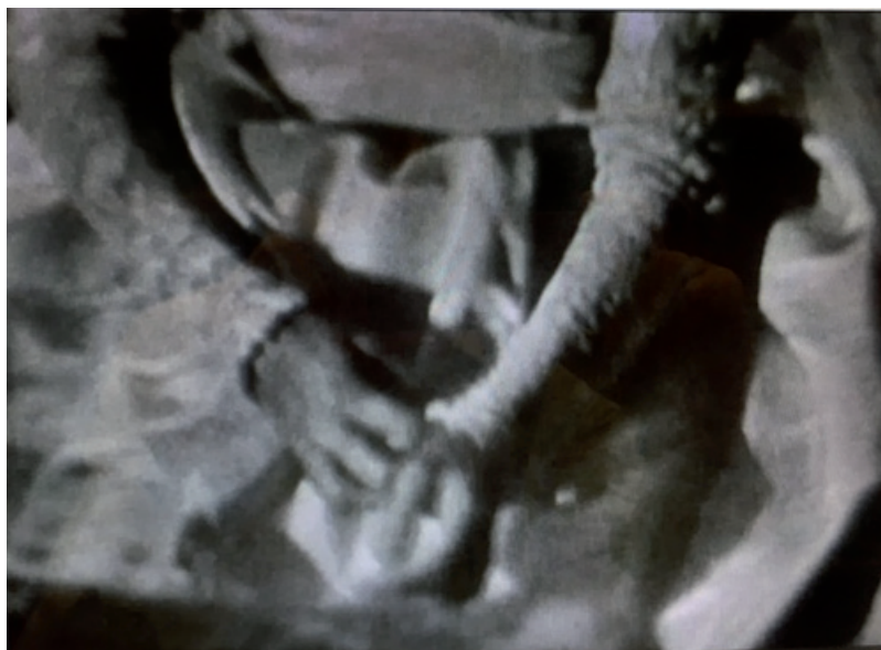
Figure 5. Grace Kelly replacing the handkerchief into her left sleeve during the ceremony as covered by television; screenshot of the 16 April 1966 edition of BBC2's Plunder .